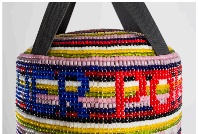
Left page: Jeffrey Gibson WHAT DO YOU WANT? WHEN DO YOU WANT IT? (detail) 2016, driftwood, hardware, wool, canvas, glass beads, Artist’s own repurposed painting, artificial sinew, metal jingles, metal studs, nylon fringe, nylon ric rac, high fire glazed ceramic, 92½" x 39" x 64".