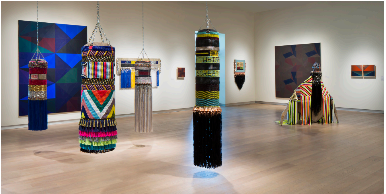
Top: Installation view of the artist's solo exhibition Jeffrey Gibson, A Kind of Confession at SCAD Museum of Art (June 23–October 23, 2016).