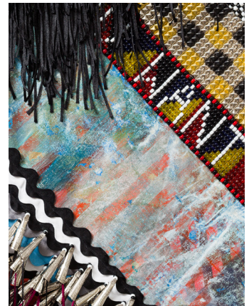
Bottom: Jeffrey Gibson WHAT DO YOU WANT? WHEN DO YOU WANT IT? 2016, driftwood, hardware, wool, canvas, glass beads, Artist's own repurposed painting, artificial sinew, metal jingles, metal studs, nylon fringe, nylon ric rac, high fire glazed ceramic, 92½" x 39" x 64". Details right.