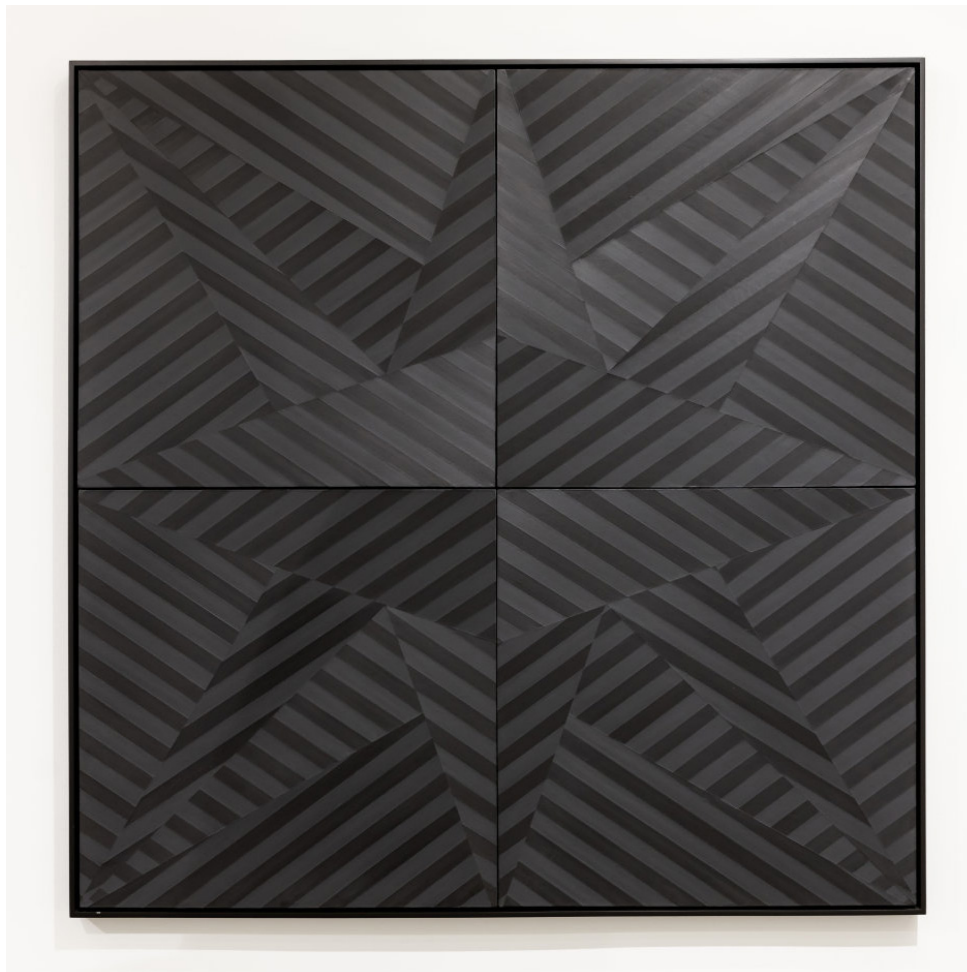
James Little, Spangled Star , 2022. Oil and wax on linen, 72 x 72 in.